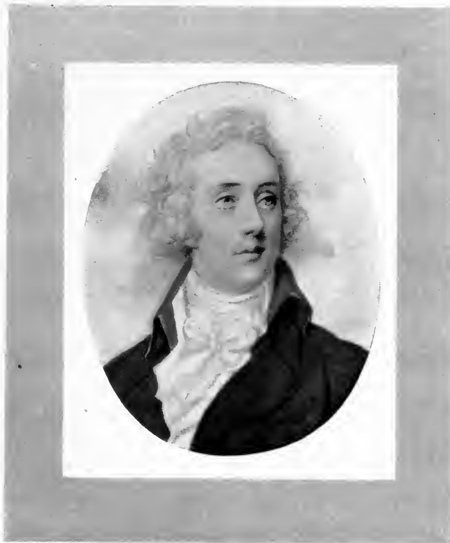
THE RT. HON. WILLIAM PITT BY HORACE HONE

FROM THE COLLECTION OF LADY MARIA PONSONBY